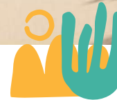
THE MARTINEZ CLUB