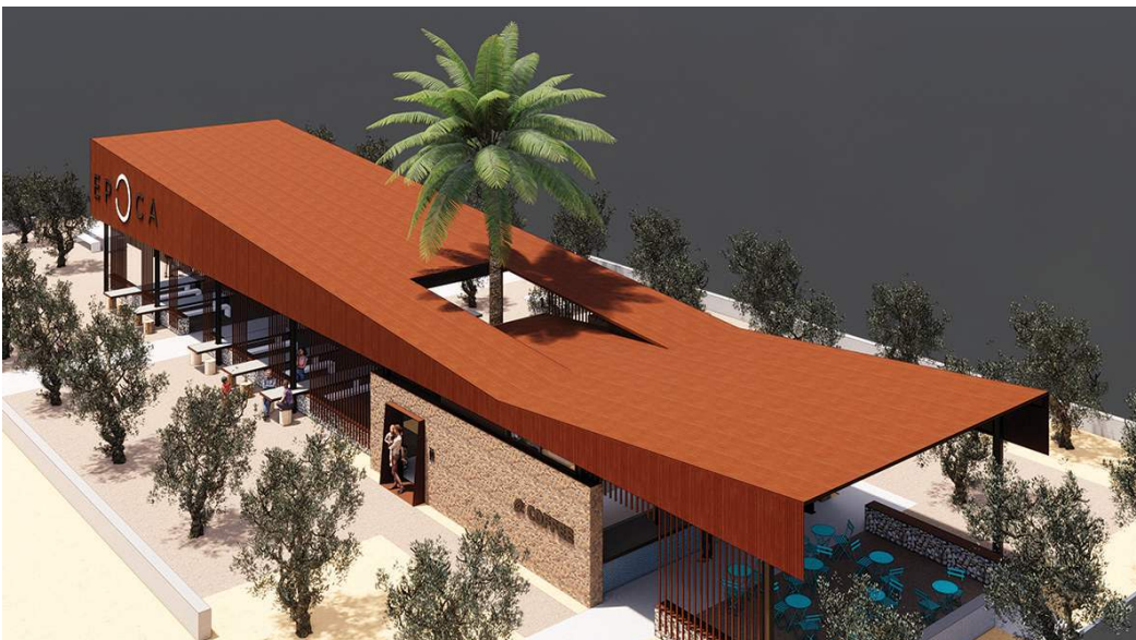
CENTRAL PARK BUILDING

"We strive for building designs that endure, that offer warmth and comfort to residents, and that age beautifully over time," offered Hanna. "The subtle color changes in materials, the natural patinas, the moss growing on the stone – these are a tribute to Epoca's timelessness."